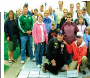
Legacy Stone Placement