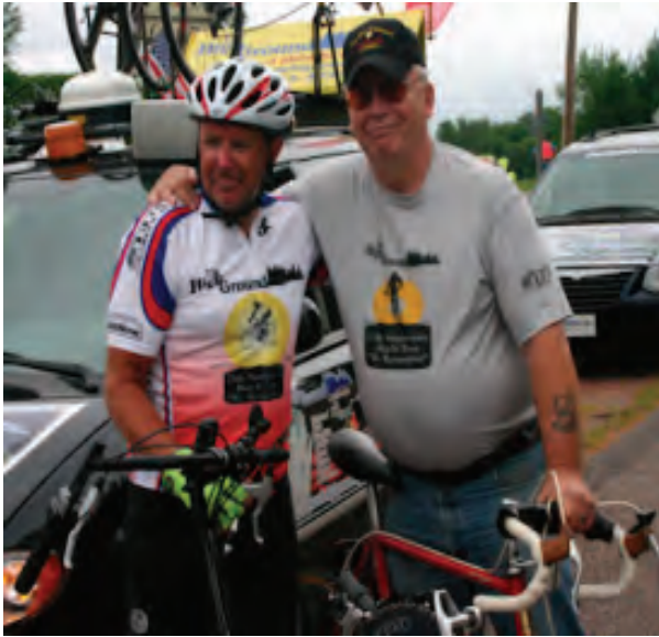
Tom (2009) and Tom (1985)