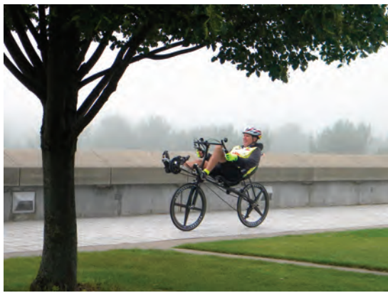
Tom leaving The Highground