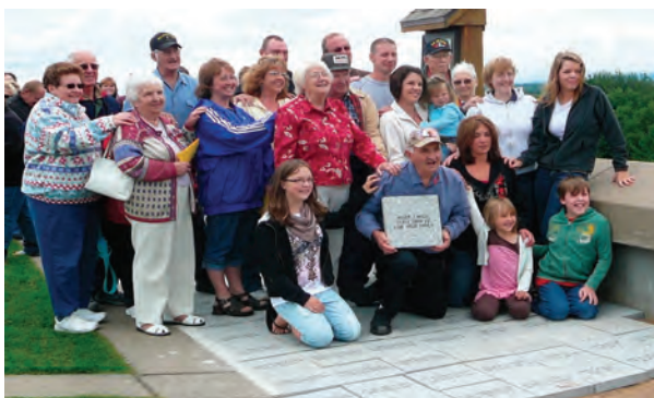
Legacy Stone Placement August 22, 2009