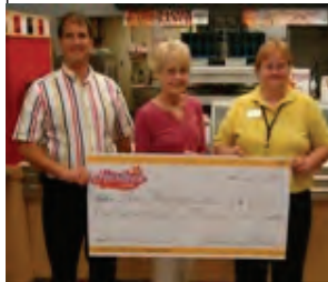
Burgers & Bash.