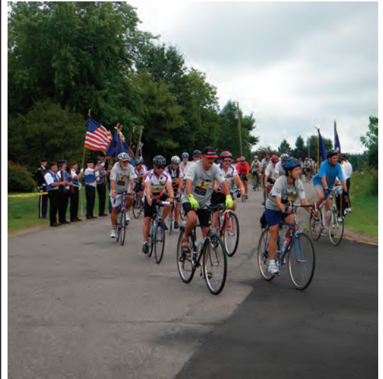
The Journey's End